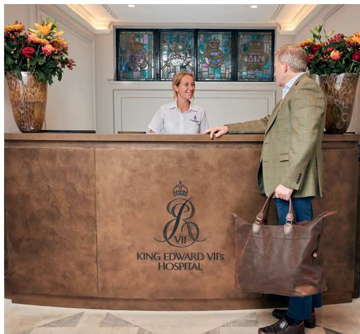
Main Hospital Reception