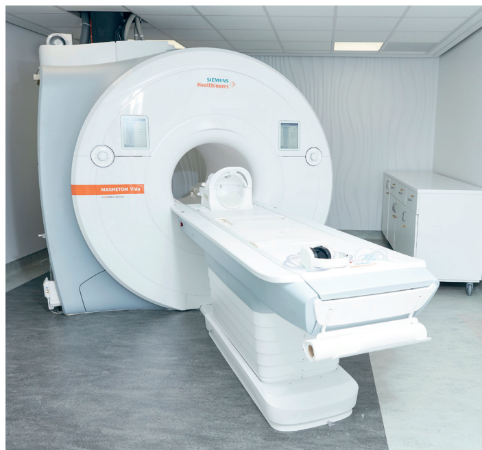
King Edward VII's Hospital Medical Centre MRI