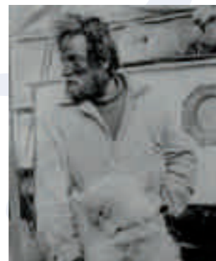
Sir Jameson Boyd Adams

He worked tirelessly to raise funds for the Hospital until his death in 1962 and his obituary in The Times concluded: "For integrity of mind and for the gift of friendship he can have had few rivals ... there was no one who could